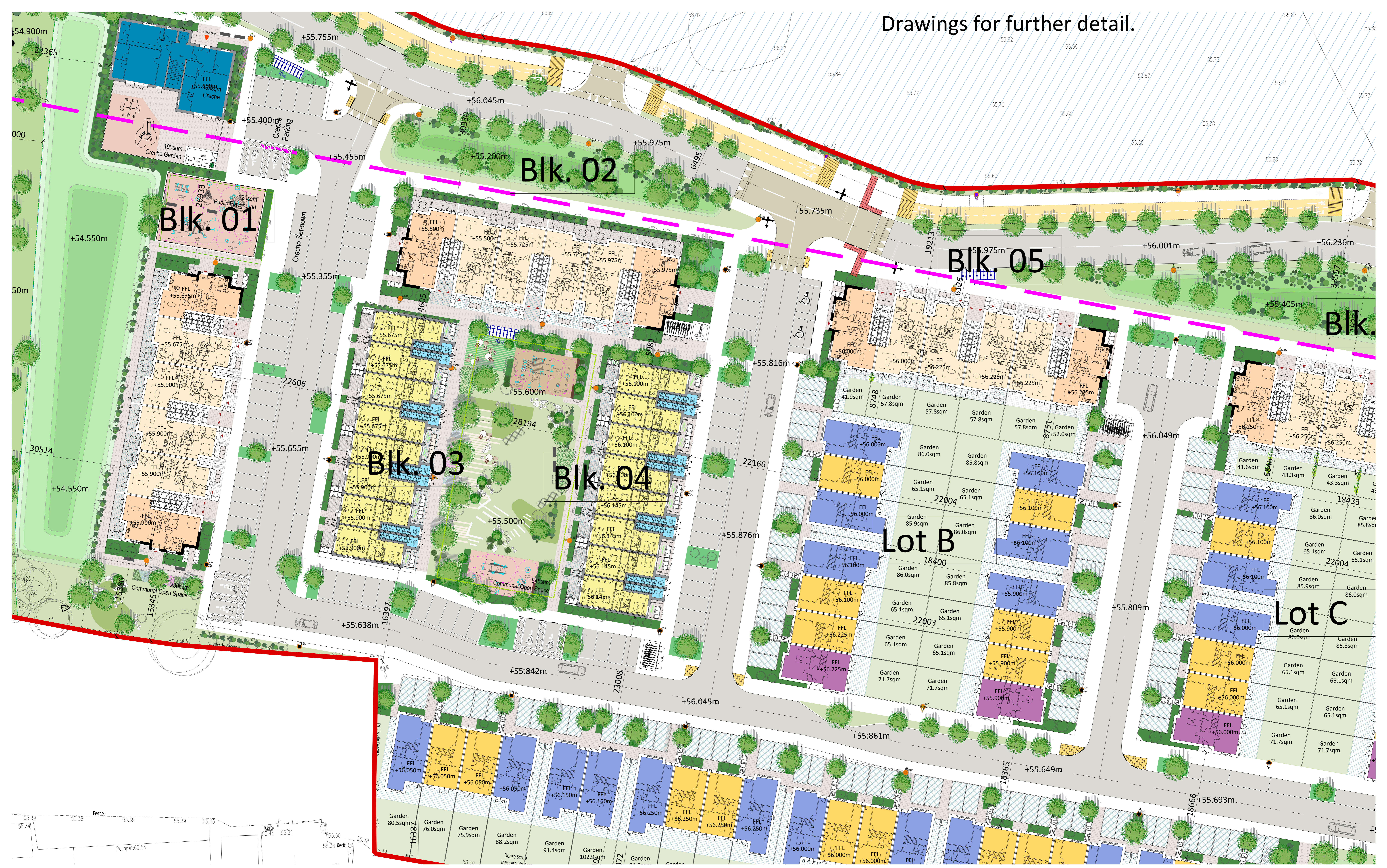
Proposed Ground Floor Plan - Sheet 01 of 05